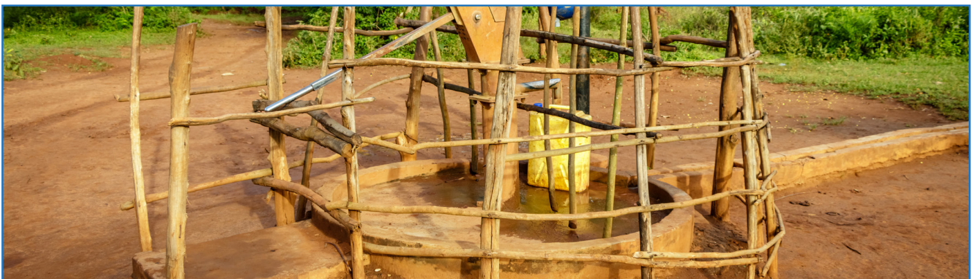
Figure 1 - A water well in Uganda

Groundwater maps and the report, results of the Mapping Groundwater Resources in Uganda Programme 2012, are publicly available. They present the location of shallow, deep boreholes and springs.